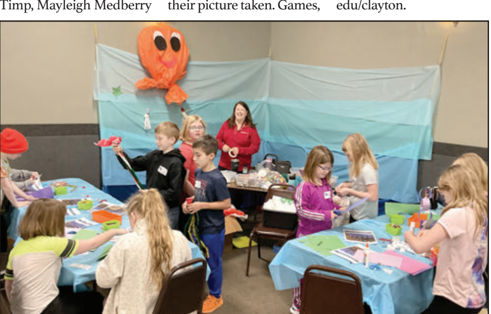
Beach Party was the theme of this year's annual Clover Kid Day. Seventy youth enjoyed a fun and educational day.

Clover Kids is a fun 4-H program for children in kindergarten through third grade. Children participate in hands-on activities designed to build different life skills. For more information on the Clover Kids youth program, visit www.extension.iastate. edu/clayton.