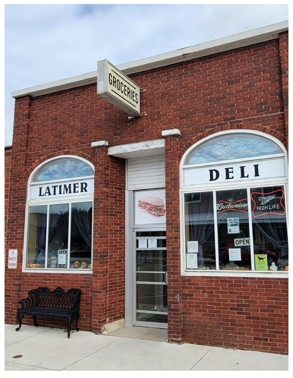
The Latimer Community Grocery at 104 N Akir St. in Latimer has passed to new owners and will be offering some new items and be serving lunch.